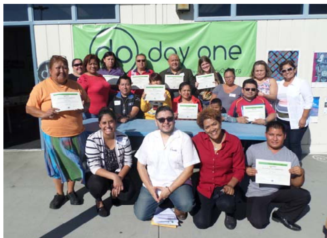
Participants from over 10 Inland Empire and San Gabriel Valley community-based organizations and worker centers display their certificates after a successful LETF training in Pomona.

If you are interested in partnering with UCLA-LOSH to offer an LETF workers' rights workshop for your members, staff, constituents, or community volunteers, contact Héctor Flores at hflores@irle.ucla.edu or 310-794-5992.