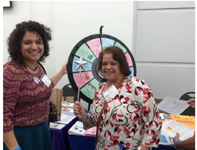
Promotoras visit resource table at Visión y Compromiso.