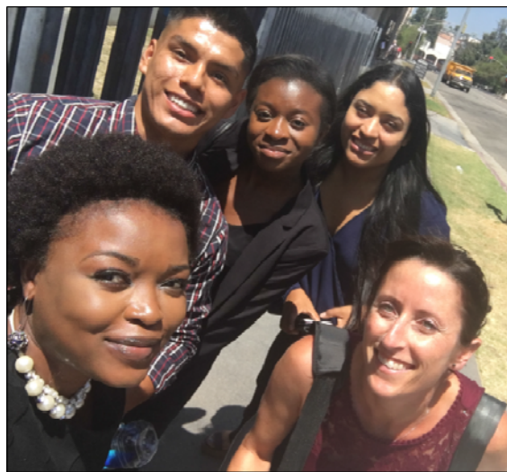
LA OHIP Interns and Staff after the National OHIP Videoconference.

Since 2004, a total of 268 students have worked on 136 OHS projects in 19 different cities. The students have learned valuable lessons about the OHS field and have contributed to groundbreaking campaigns around the country.