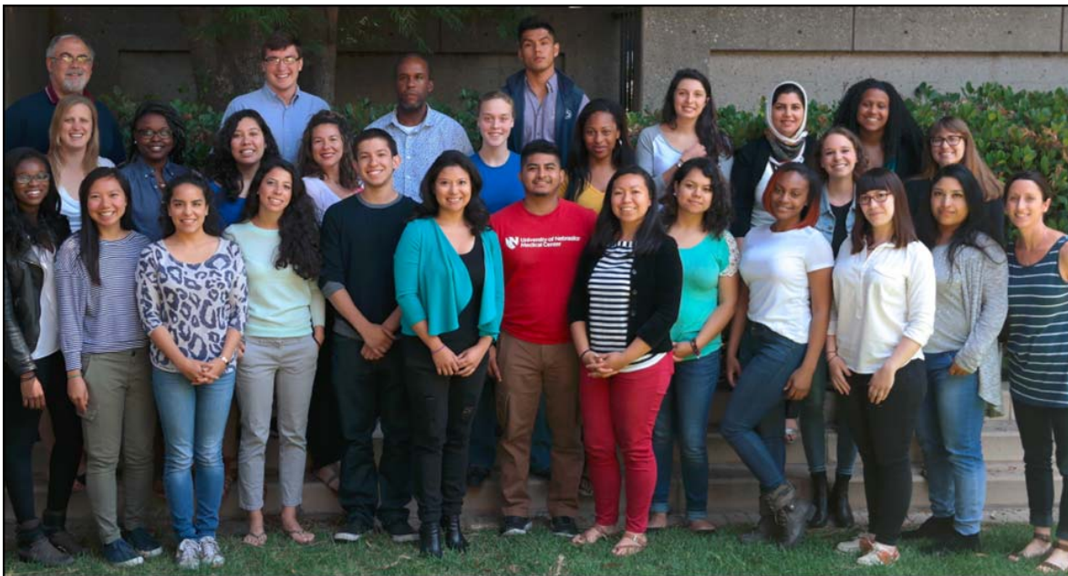
National OHIP Orientation (June 14-16 at UCLA) – 2016 OHIP Interns and Staff

This summer, UCLA-LOSH hosted the national Occupational Health Internship Program (OHIP) orientation for 24 interns placed with labor and community groups at ten sites across the country. From California, New York and Boston to New Orleans and Nebraska, the interns supported campaigns to improve conditions for poultry processing, seafood, transportation and forest workers. Interns in Los Angeles worked with the Black Women for Wellness Healthy Hair Initiative to assess chemical exposures and health concerns among stylists, salon owners and cosmetology students; others documented the injury experiences of day laborers in collaboration with the National Day Laborers Organizing Network.