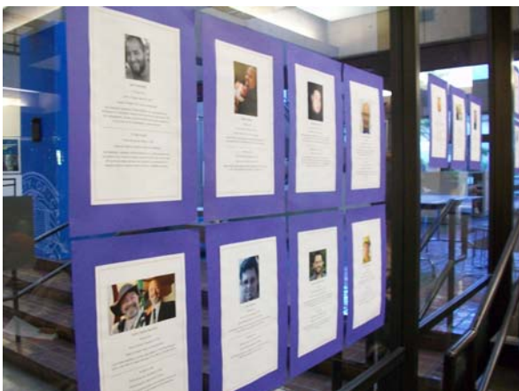
Posters of workers who died on the job were on display.

of work. Interviews with family members, workers, health and safety activists and legal experts highlight the importance of legislation to ensure employers do not contract with third parties to avoid their responsibilities.