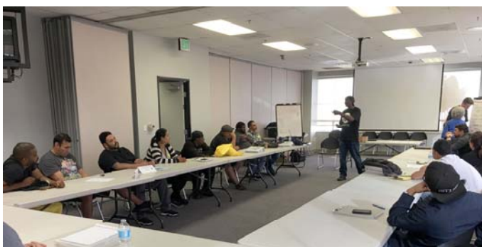
Equipment and lighting are improved in the temperature-controlled classrooms at the new training site.